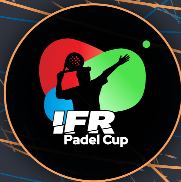
IFR PADEL CUP