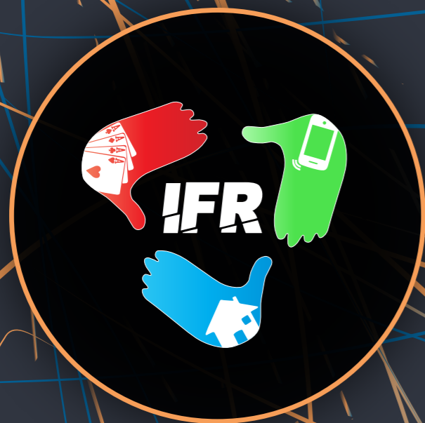
IFR CHAMPIONS CUP