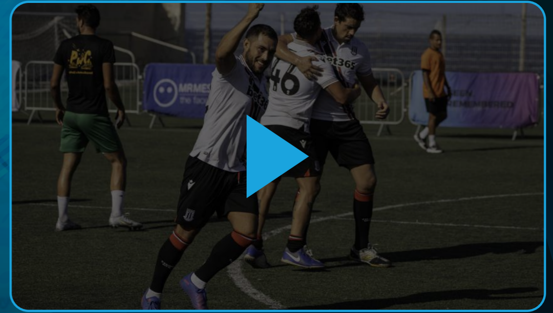
Official Aftermovie | IFR Champions Cup 2022